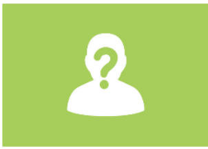
Online Grooming Parent's Guide