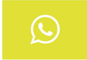
WhatsApp Parent's Guide