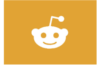
Reddit Parent's Guide

https://nationalonlinesafety.com/resources/platform-guides/