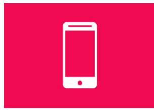
Screen Addiction Parent's Guide