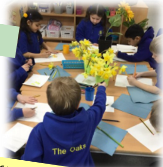
Craft Club for Y1 & Y2