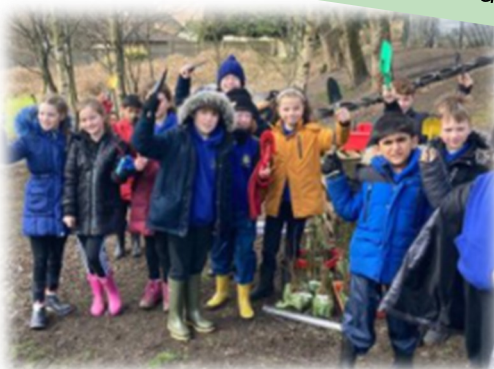
Eco Council planted trees